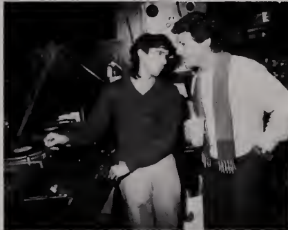
VENUS AT THE FUNHOUSE — Frankie Avalon (r) recently premiered his new single, "Innocent" at New York's Funhouse. The singer is shown chatting with club DJ John "Jellybean" Benitez, who mixed the new record.

EAST COASTINGS — Happy Sue Year: RCA recording group War has filed a complaint against Far Out Inc., its management and production firm of 13 years. The Florida-filed action charges Far Out with "fraud, negligence and breach of contract" . . . Meanwhile, a Boston suit brought by Great Western International Entertainment Corporation, a management and production company, against New York-based music industry lawyers Machat & Machat charges the legal firm with falsely representing themselves as the manager of the group Fighter , and interfering with negotiations between Great Western and A&M Records . . . MTV has been added to Manhattan's Group W Cable, which extends from 86th Street on the East Side and 79th Street on the West Side to the northernmost tip of Manhattan. The addition of the cable brings MTV